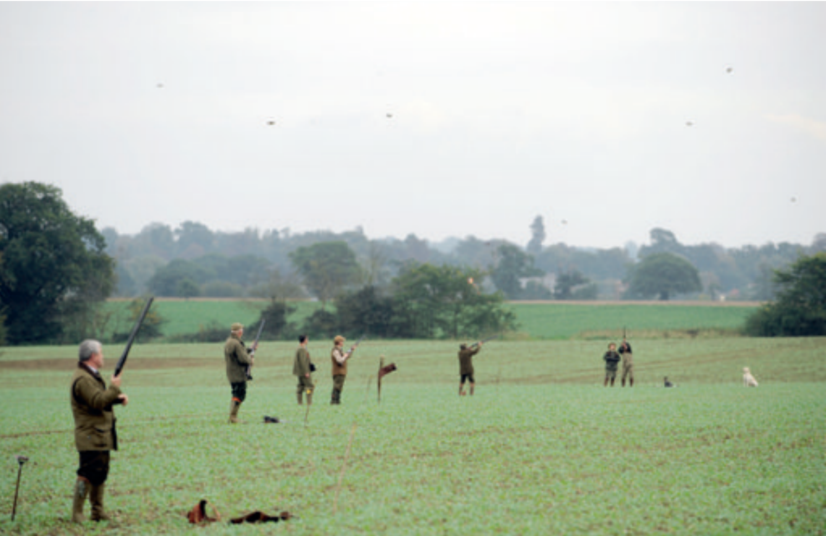
Guns at Stowlangtoft can expect large coveys of challenging partridge on every drive.