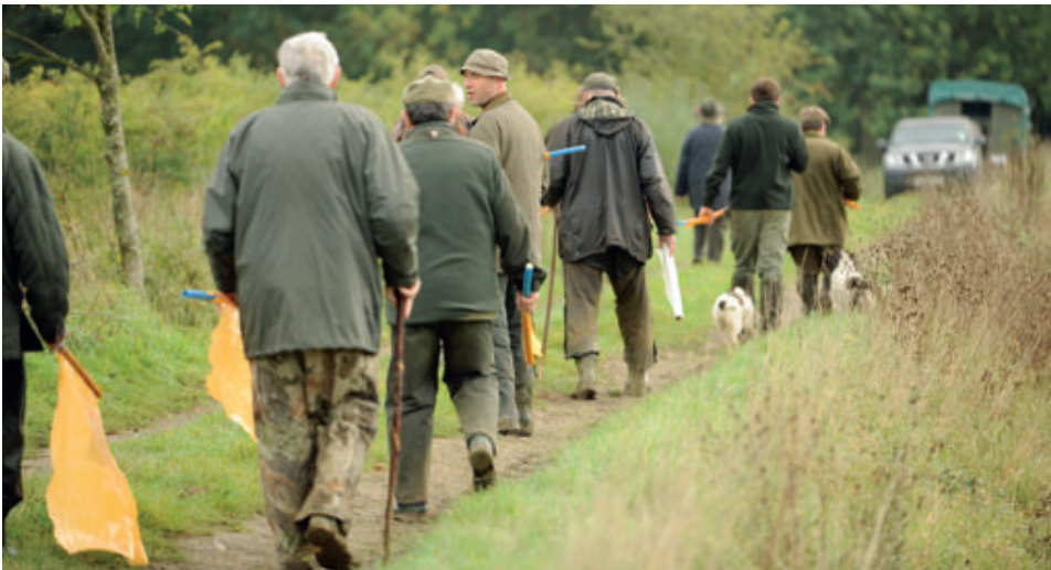
An experienced team of beaters and pickers-up can be relied upon to produce exciting sport.