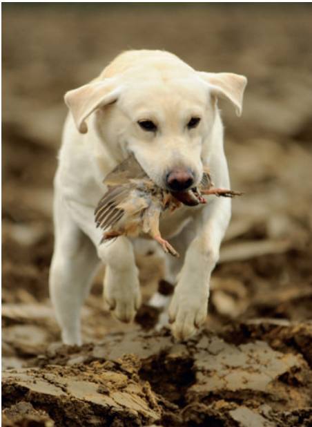
The variety in terrain at Stowlangtoft will present a real challenge for dogs.

"I have been involved in running the shoot for the past eight years, my father for 45 years. The shoot hasn't changed significantly in this time, however Stowlangtoft has always been a shooting estate and we are always looking at ways to improve it, whether by creating new drives, planting hedges, or improving the estate infrastructure. "We have not really been affected