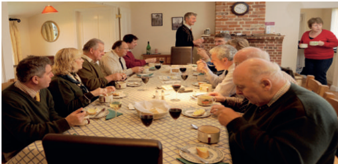
The shoot lodge is a warm and welcoming venue ideal for deconstructing the day's performance.

THE HEART of the Stowlangtoft estate is in fact not the grand 150-year-old hall, but a small collection of traditional farm buildings over the road from the Catchpole family home. Traditional black weatherboarding covers the buildings, the beaters making themselves at home in an old grain store complete with the expected battered sofas. The guns, meanwhile, meet in the shoot lodge, a recently renovated barn which is complete with a kitchen, large dining table and a porch where the guns can leave their muddy boots and wet coats. The day starts with tea and coffee in front of a roaring fire, before the guns head out into the