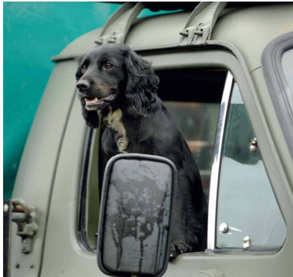
An eager resident is ready for the off.